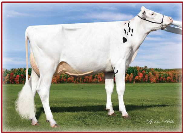
DAM: MS AIJA MIRAND MANDY-ET VG-85